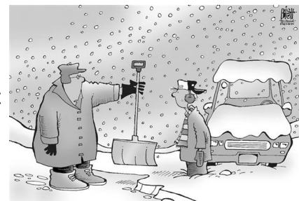
SORRY, SON... THERE'S NO APP FOR THAT

SNOW REMOVAL VOLUNTEERS NEEDED! With the arrival of fall, we know that snow won't be far behind. We do hire a service for the large parking lot areas, and we have a couple of volunteers who have agreed to help us out again this winter. THANK YOU!! But we are looking for people who can help our current volunteers with the sidewalks and smaller areas around the church and school. There is a snow blower available to use at the church. If this is something you feel you could help with, please call the parish office at 361-5252. May God bless you abundantly!