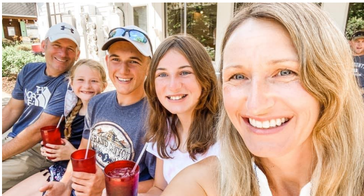
KC Family of the Month