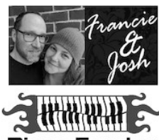
Piano Fondue Cabaret Favorites