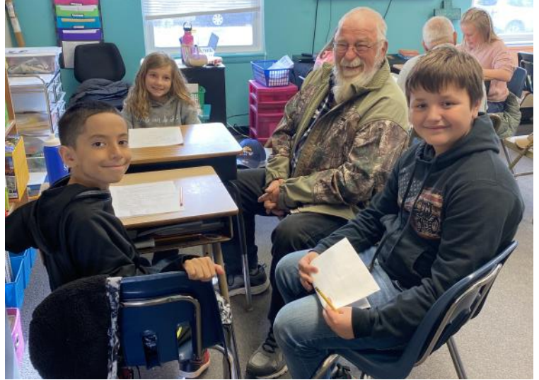
4th Grade students at All Saints Catholic School met with area veterans earlier in the month to learn about their experience in the military.